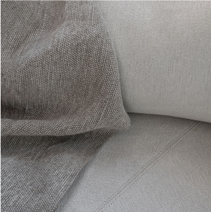
Fred, to the left, draped over a sofa in upholstery fabric Oostende.